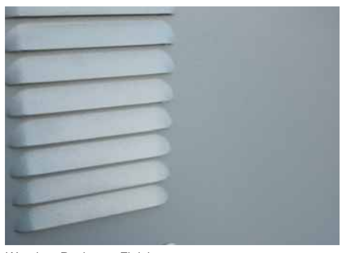
Weather Resistant Finish

Patented powder coated finish designed to withstand biting wind and heavy rain conditions. Powder-coating offers a tough, scratch- and stain-resistant finish.